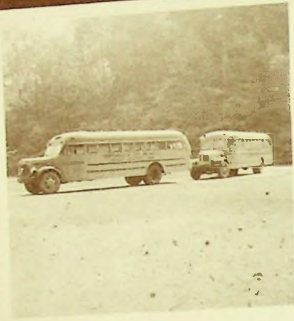
Our Transportat ion