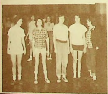
Oh! What back breaking exercises