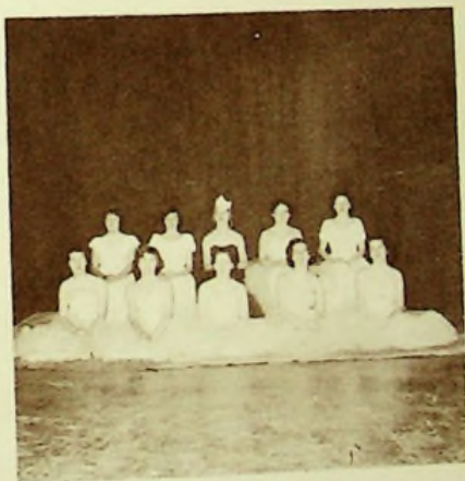
May Queen and Attendants